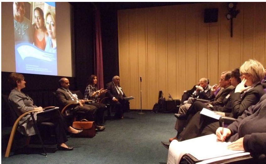
ACCP partners present the “10 Key Findings and Recommendations” at a Washington, DC dissemination event in 2008

(especially the HPV test group) than in the delayed treatment group. Specifically, by 12 months, CIN 2+ had been diagnosed among 1.4% (95% CI: 0.87–1.97) of women in the HPV arm, 2.9% (95% CI: 2.12–3.69) in the VIA arm and 5.4% (95% CI: 4.31–6.50) in the delayed evaluation group. No adverse treatment results were identified and the authors concluded that both screen-and-treat approaches are safe and effectively reduce disease occurrence. 35