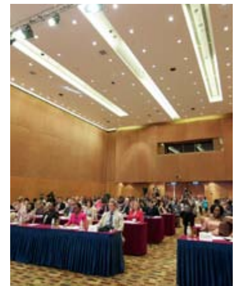
Opening Plenary Session

Education – both at the government and community level – is an important